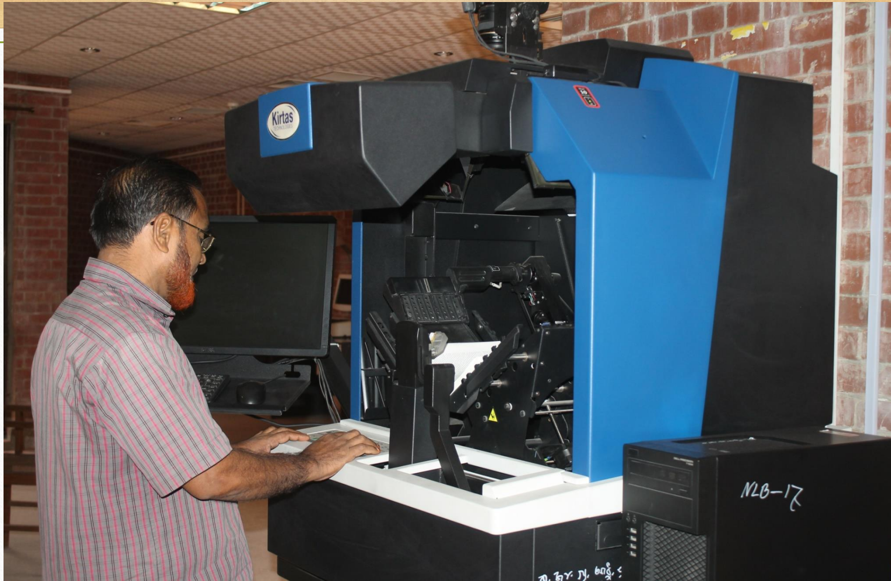
Digitization of documents using Automatic Book Scanner