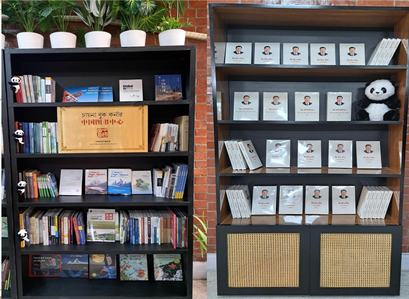
Books (From CICG) at the China Book Corner of NLB