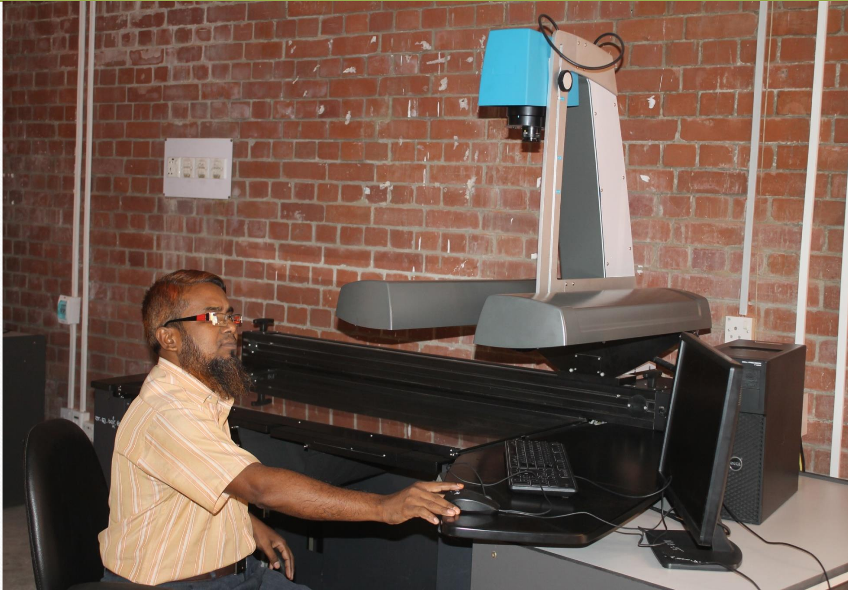
Digitization of Maps by HD Flatbed Scanner