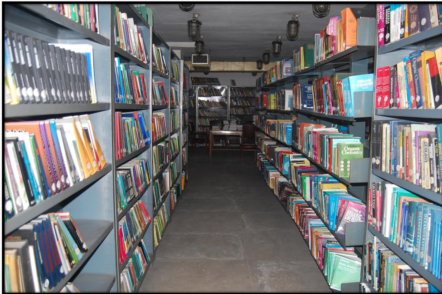
Preservation of Books from 1947 in the stack block