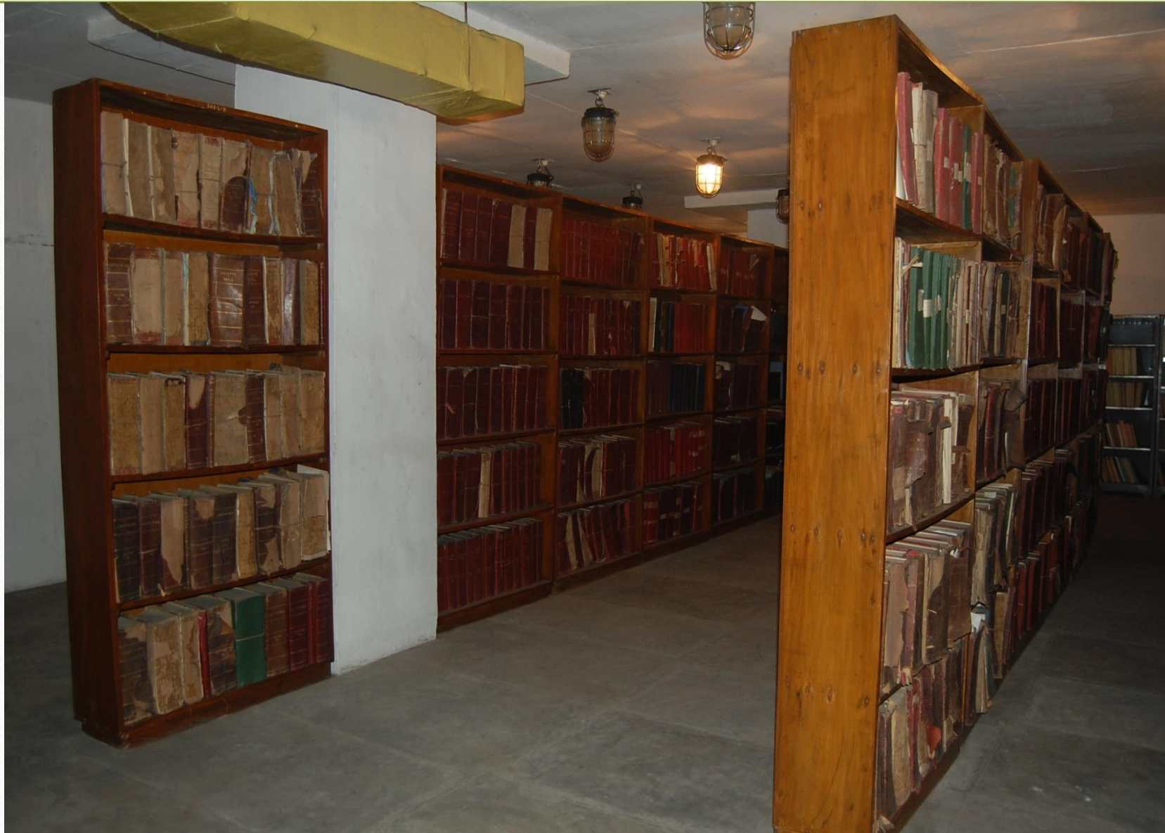
Preservation of Gazettes from 1801