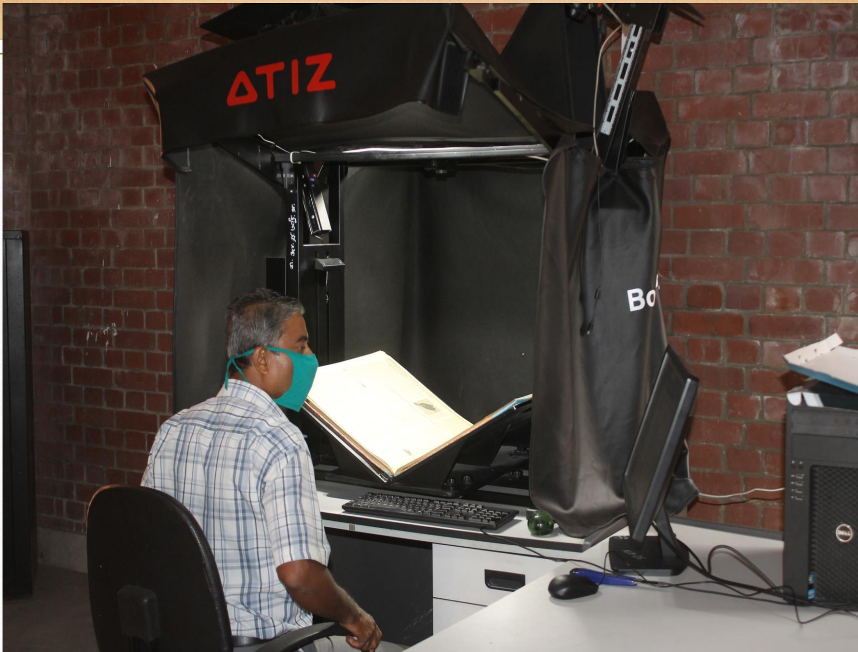
Digitisation of Binding Newspaper