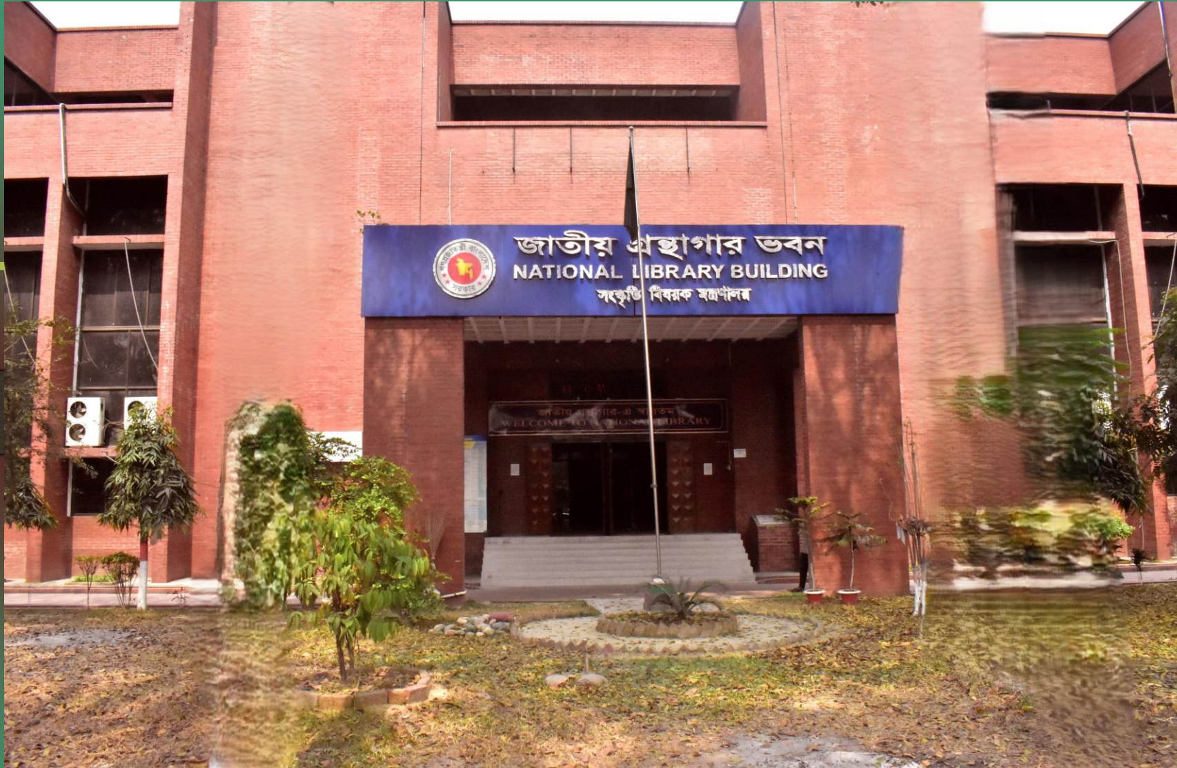
Front view of the National Library Building