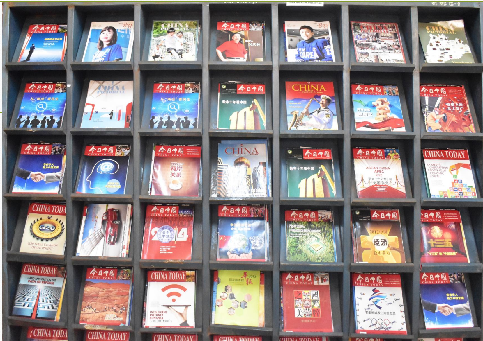
Magazine at the China Book Corner