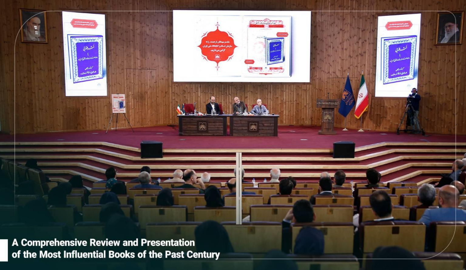
A Comprehensive Review and Presentation of the Most Influential Books of the Past Century