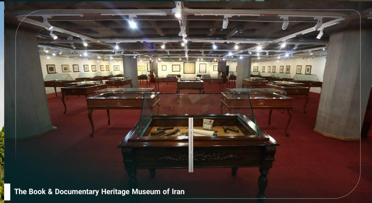
The Book & Documentary Heritage Museum of Iran