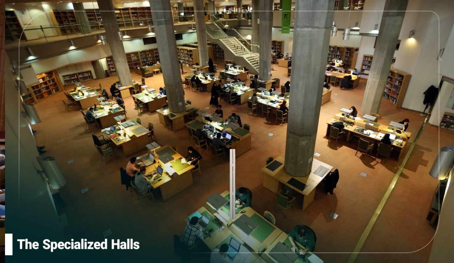
The Specialized Halls