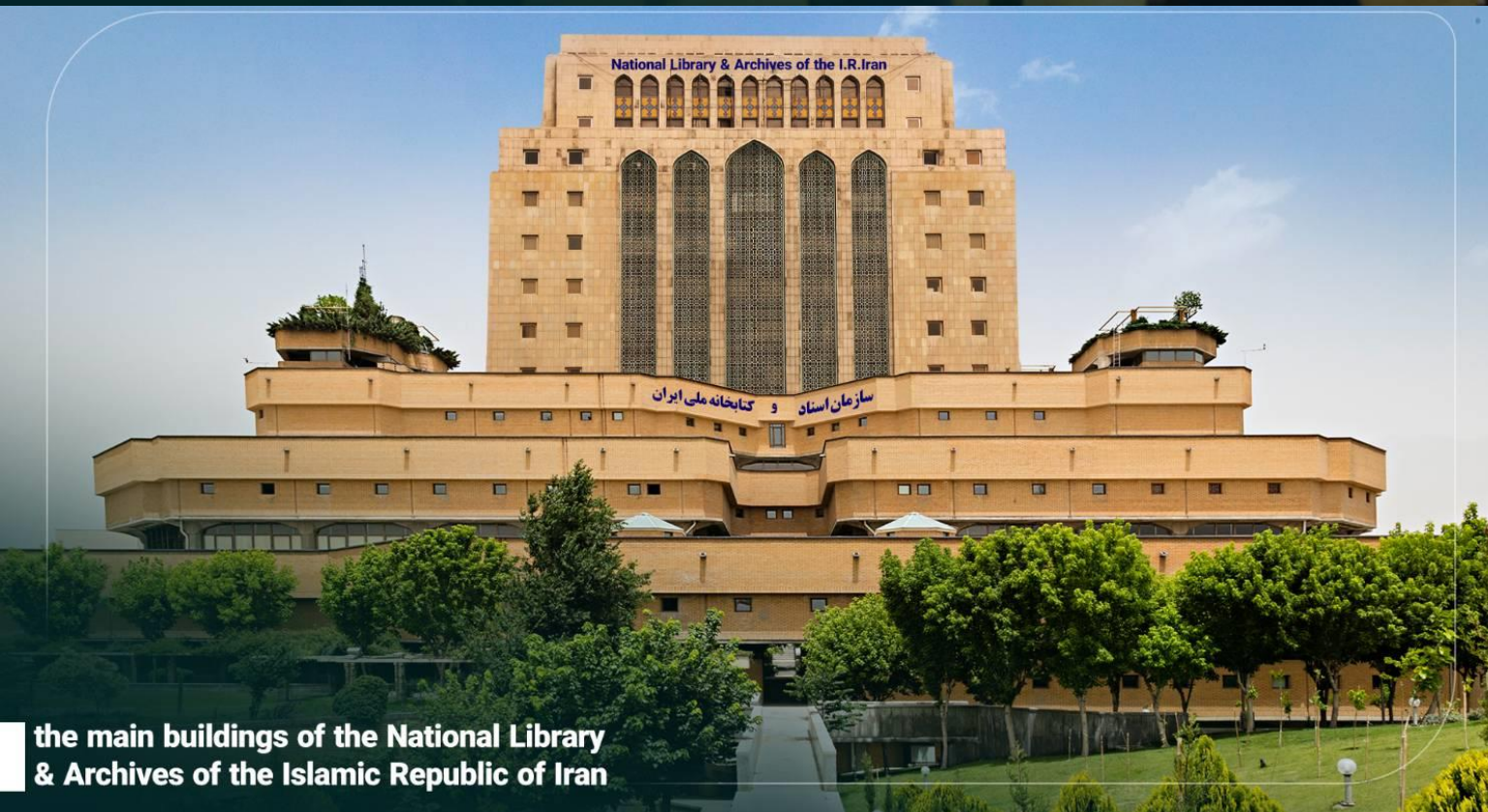
the main buildings of the National Library & Archives of the Islamic Republic of Iran